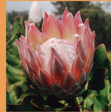
King protea: Protea cynaroides Comments: Very large heads, 8 to 12 inches, with soft pink coloring. Leaves are leathery and may be used for pavé or other basing techniques.