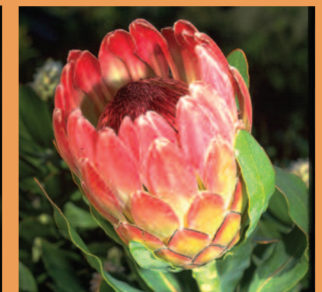
Sugarbush: Protea repens Comments: A good substitute for Pink Mink in form and size, these flowers lack the black-tipped edges and fuzzy texture.