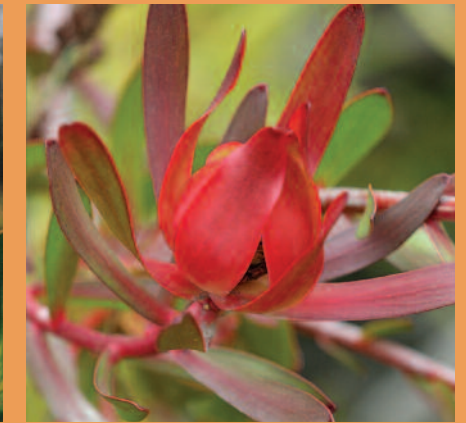
Leucadendron: Leucadendron salignum Comments: Resembling colored foliage, these proteas actually have a very small flower surrounded by colorful bracts atop each stem. Stems are 12 to 24 inches long.