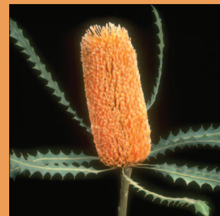
Banksia: Banksia prionotes , B. hookeriana , B. menziesii , B. coccinea Comments: Several sizes, 6 to 10 inch heads, and a variety of colors (yellow, golden, rust) are available. Leaves have a saw-blade edge and may be used separately from the blossom.