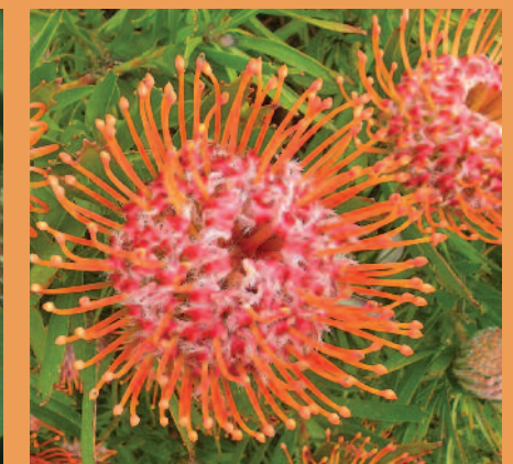
Pincushion protea: Leucospermum cordifolium , L. nutans Comments: The porcupine appearance of this flower (3 to 5 inches in diameter) is deceptive; the "spikes" are actually very pliable and not harmful.