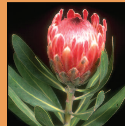
Pink Ice: Protea hybrid Comments: Similar to Pink Mink and slightly smaller, these flowers have a white sheen to the petals (bracts).