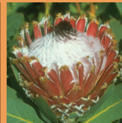
Queen protea: Protea magnifica Comments: Smaller than the King, these flowers have a high crested black center. They are 6 to 8 inches in diameter.